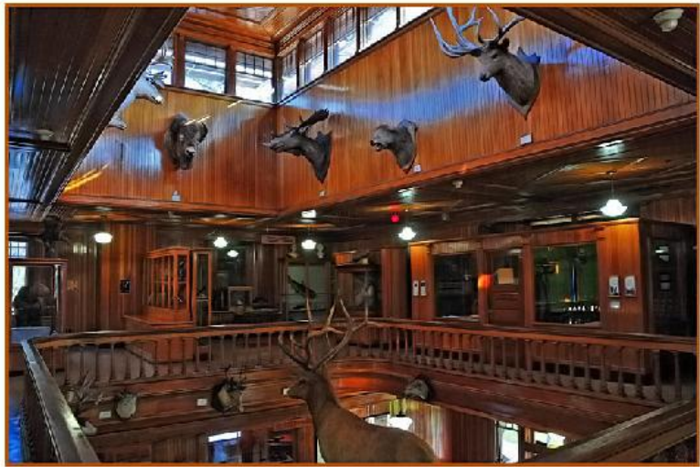
Banff Park Museum

almost 3000 meters high. In the afternoon, we'll go South to visit an important scenic area rich in other lakes, some interesting geological structures, the Hoodoos, impressive limestone formations of the Rocks, which lie towards the road to visit, then further South, Vermillion Lake with mount Rundle and Minnewanka Lake in the Valley of Paradise. Everything is