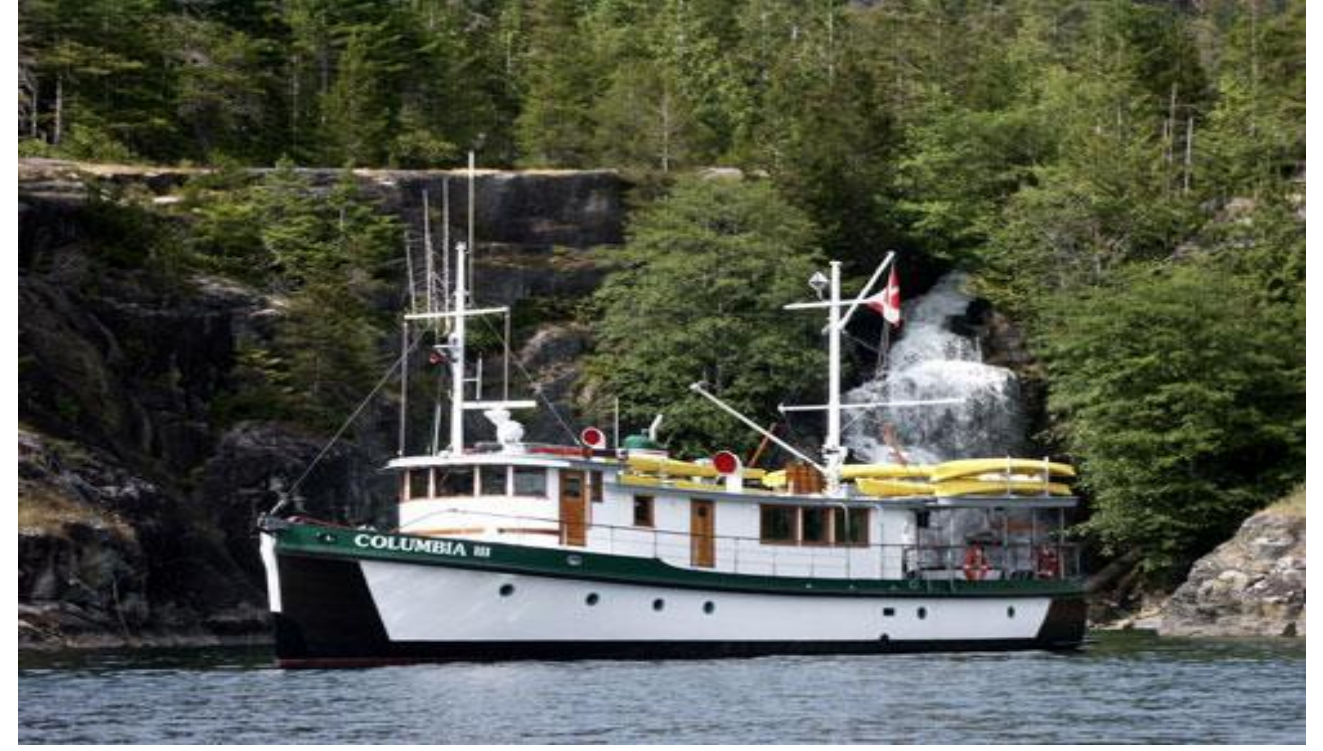
offers a unique opportunity to observe and photograph these beautiful specimens of black bear close enough in their natural habitat! At the end of the excursion, you will head to the E ast coast of Vancouver Island to Campbell River, and check in the Painter's Lodge.